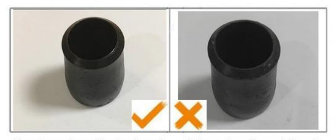
Round smooth mouth, clear threads